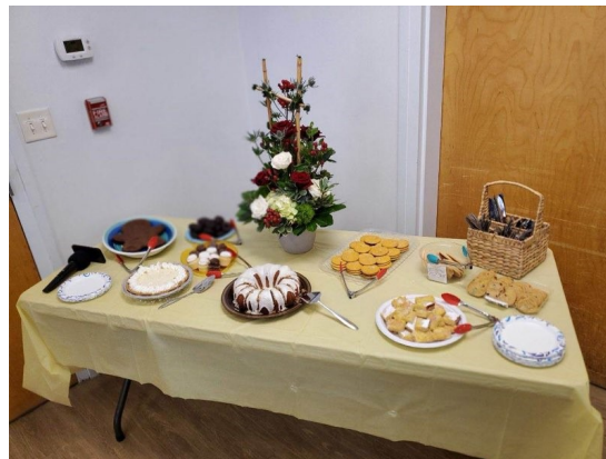
The Dessert Table