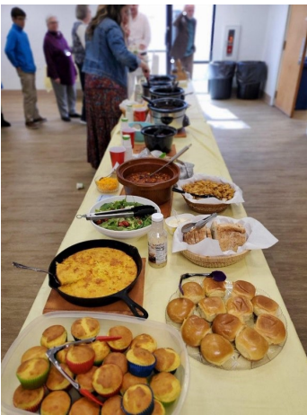
All the Choices